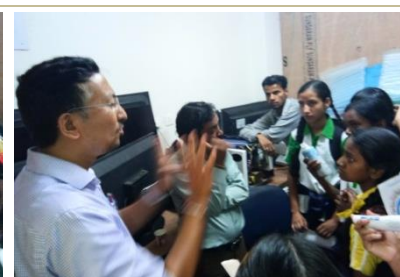
Interactive programme at Samsung Service Centre