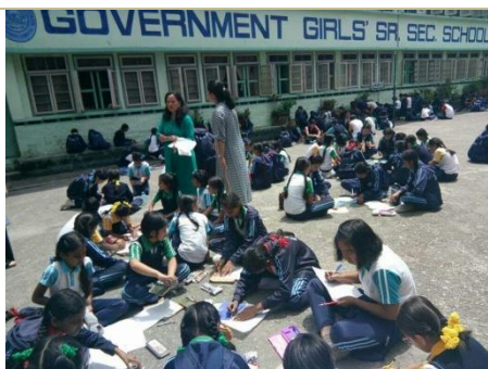
Painting competition at schools