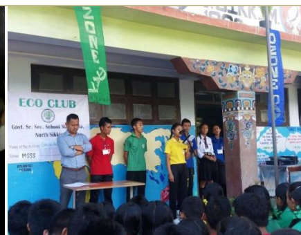
Morning assembly programme