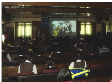
Screening at Forest Secretariat