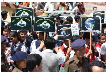
Rally / banner campaign by students across the State