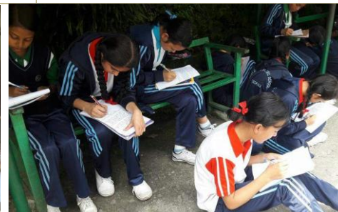
Painting and slogan writing competition at schools