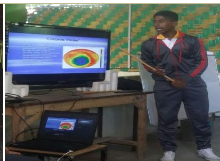
Video ppt by students/ teachers