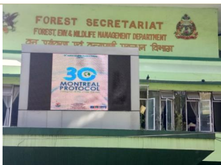
Publicity through digital boards