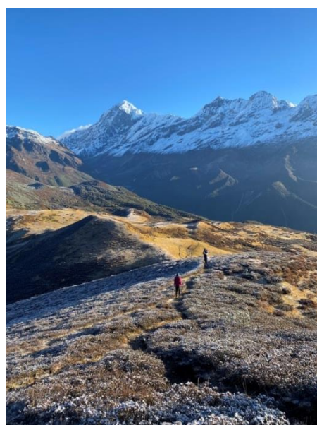
2<sup>ND</sup> DECHEN CHODEN BHUTIA (F, 25) R/o- Singyang, West Sikkim

Caption: No gas, no harmful emissions. Just using our Legs and living on less. Sustainability comes from within, choose wisely and choose ecological friendly activities. Appreciate what's around before it's too late.