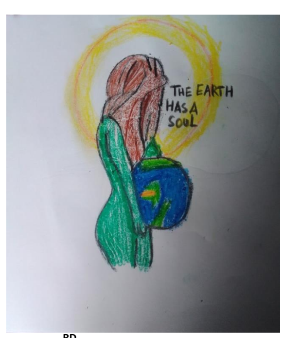
3<sup>RD</sup> HISHEY DIKI BHUTIA CLASS V, TASHI NAMGYAL ACADEMY, EAST SIKKIM