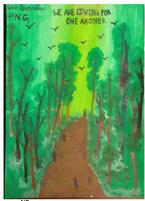
2<sup>ND</sup> LAWMNAKIM LEPCHA CLASS V, PALZOR NAMGAY GIRLS SCHOOL, EAST SIKKIM

CLASS III, DAFFODILS HOME SECONDARY SCHOOL, GANGTOK, EAST SIKKIM