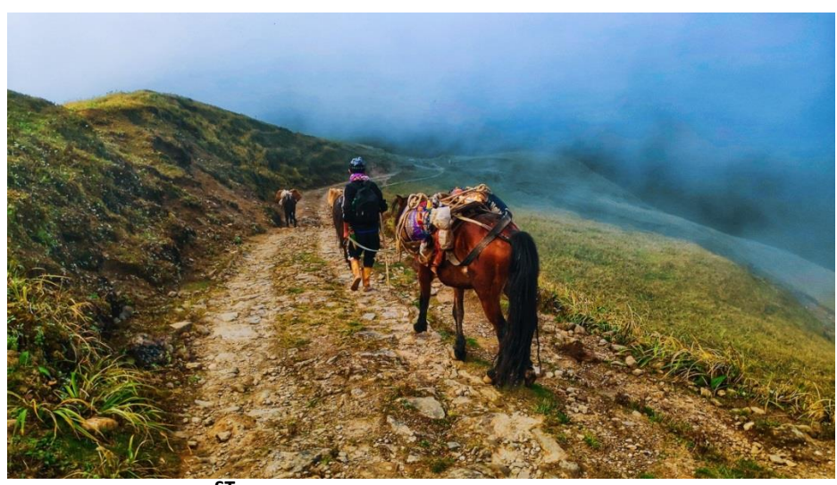
1<sup>ST</sup> – DHERAJ NEOPANEY (M, 28) R/o- Rhenock Upper khamdong, Pakyong District Caption: Himalayan life (Sustainable Life)