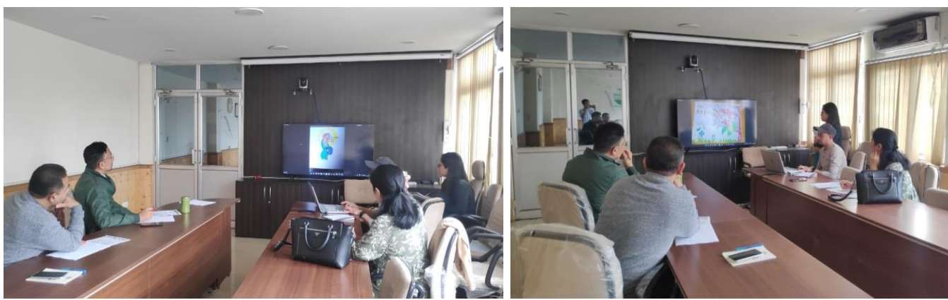
The Selection Committee met on June 21, 2022 at SPCB conference hall, C Block, Forest Secretariat.