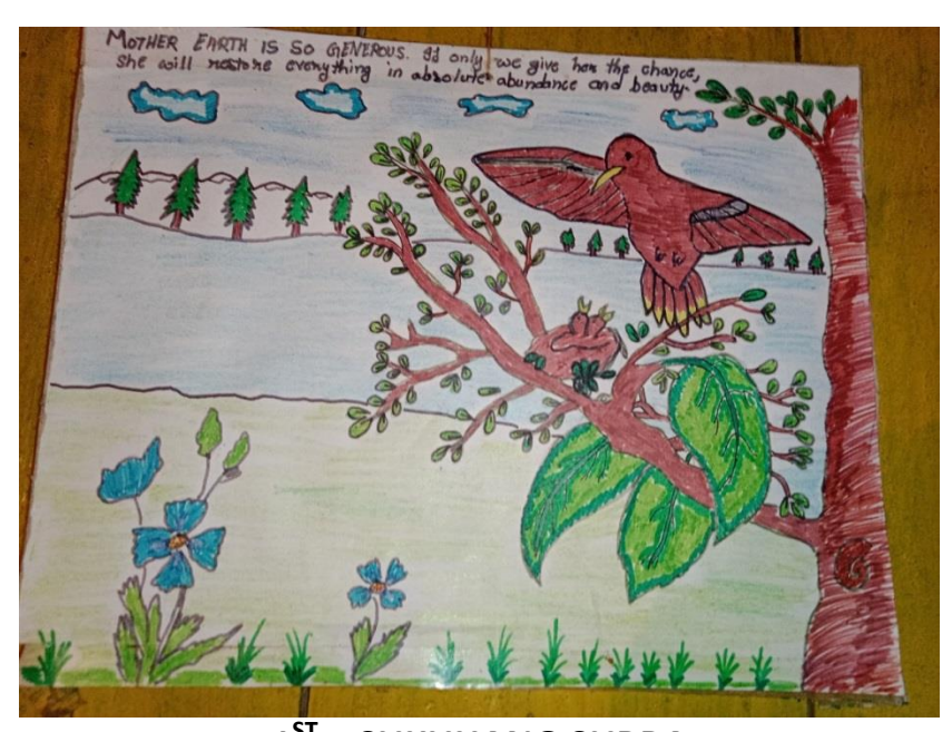
1<sup>ST</sup> – SUKUHANG SUBBA

CLASS III, DAFFODILS HOME SECONDARY SCHOOL, GANGTOK, EAST SIKKIM