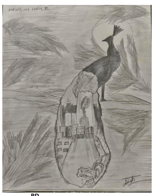
3<sup>RD</sup> SHIVESH PRADHAN CLASS VII, TASHI NAMGYAL ACADEMY, EAST SIKKIM