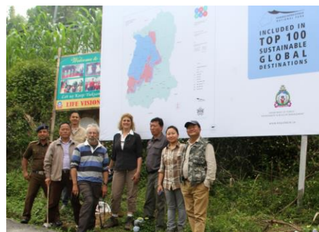
Field visit to KNP on West part of Sikkim