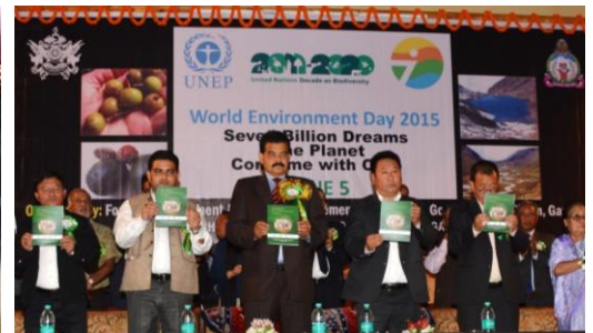
Release of booklet on Nature based Festivals