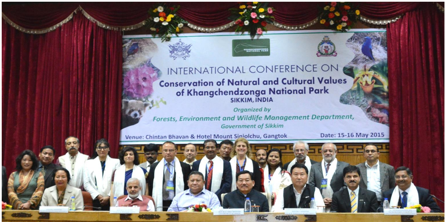
Picture: The Hon'ble Chief Minister of Sikkim Shri. Pawan Chamling with his cabinet colleagues and senior government officers in a group photo with national and international delegates at Chintan Bhawan, Gangtok

Organized by the Forest, Environment & Wildlife Management Department, Government of Sikkim at Chintan Bhawan the Hon'ble Chief Minister Shri. Pawan Chamling graced the inaugural session of the International Conference as the Chief Guest.