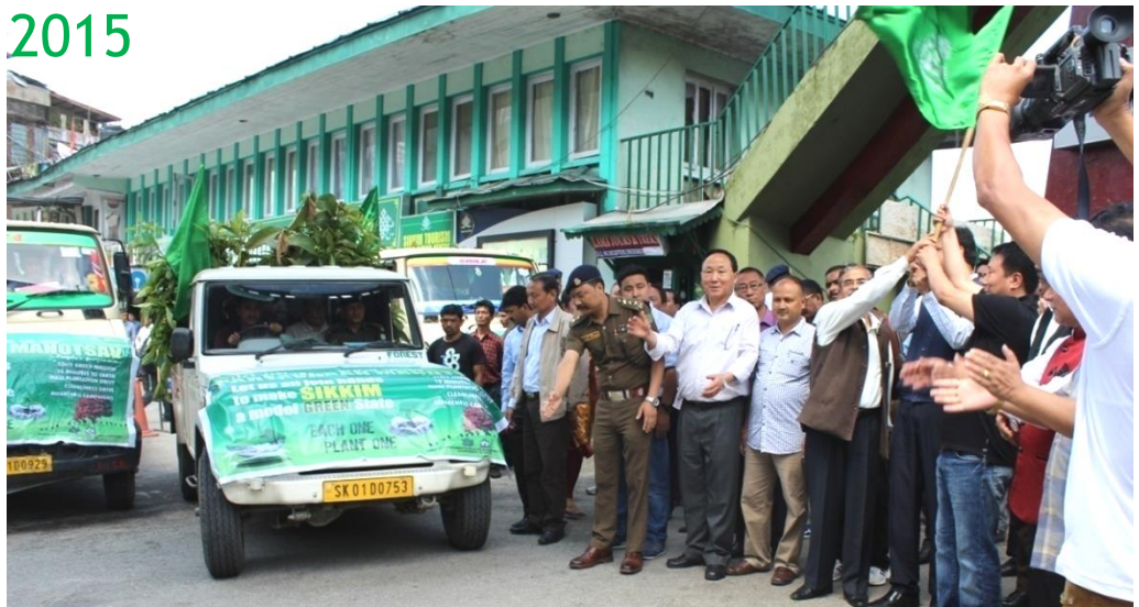
Seedling distribution vans being flagged off by the Hon'ble Minister Forests, Shri Tshering Wangdi Lepcha