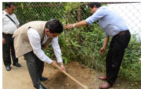
Plantation by Shri. A. K. Ghatani, Minister (Health)