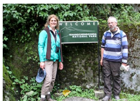
Foreign delegates at their delight at KNP