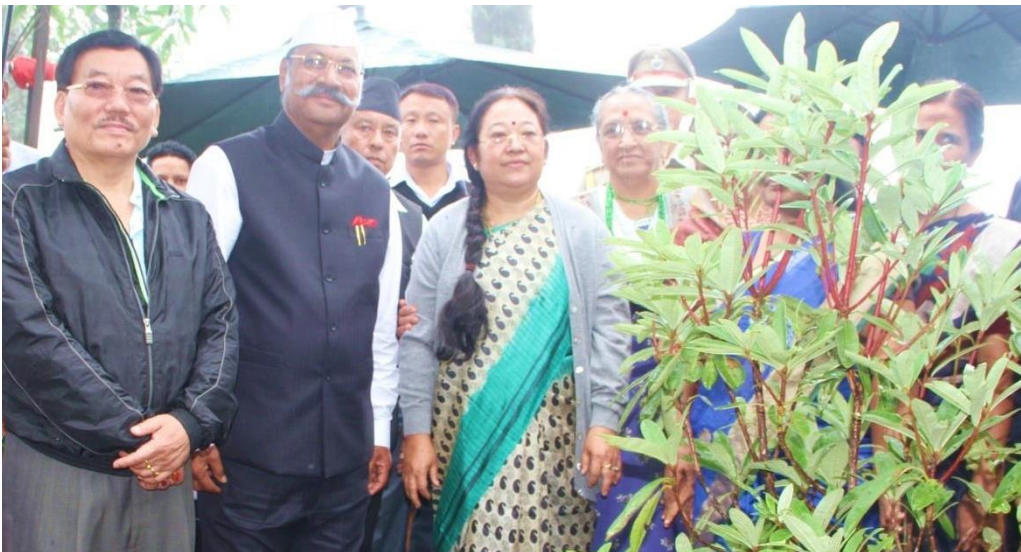
Hon'ble Governor Shri Shrinivas Patil and the Hon'ble Chief Minister Shri Pawan Chamling with the first lady Smt. Rajanidevi Shrinivas Patil and Smt. Tika Maya Chamling planted Rhododendron saplings each at VIP colony, Gangtok during the Ten Minutes to Earth ceremonial plantation programme on 25 th June 2015.