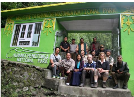
Forest officials and local stakeholder's hospitality for foreign delegates at KNP Yuksam Range