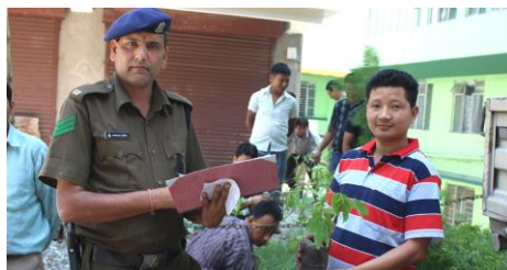
Forest officials taking stock of seedling distribution