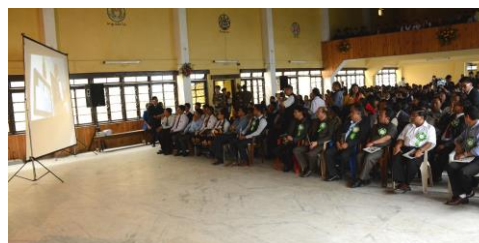
Screening of Green Schools Programme Sikkim