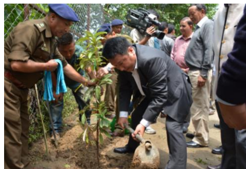
Plantation by Shri. T. W. Lepcha, Minister (Forests)