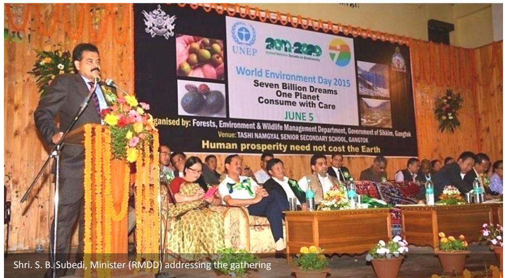
Shri. S. B. Subedi, Minister (RMDD) addressing the gathering

ENVIS Centre publication on Nepali and English languages highlighting the environment initiative of the Government of Sikkim from 1995 to 2015 was also released during the Press Conference on the eve of environment day by the Hon'ble Forest Minister Shri T.W. Lepcha.