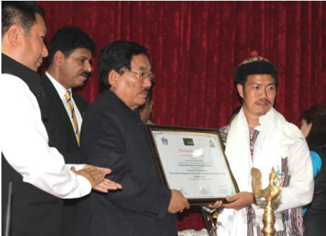
Awards to Himal Rakshaks/ EDC members/ NGOs