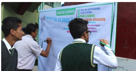
Students taking part in the signature campaign