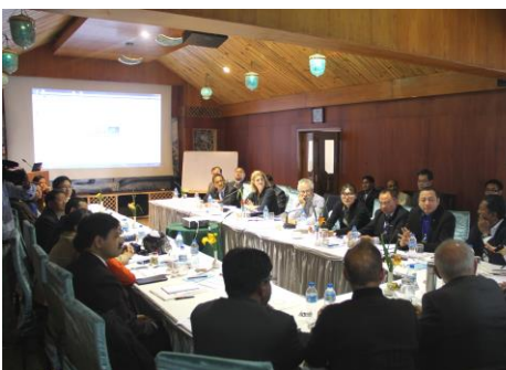
Technical session at Hotel Siniolchu on Day 2