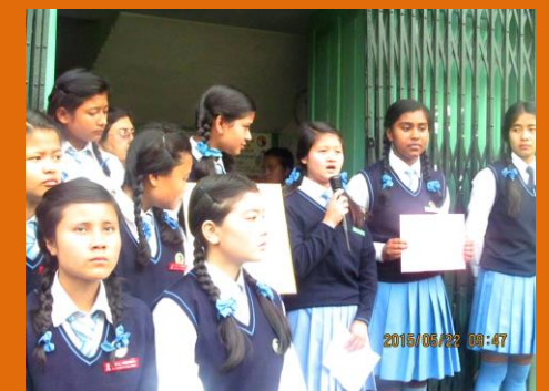
Environment Health Club of Deorali Girls' Sr. Secondary School observing IBD 2015