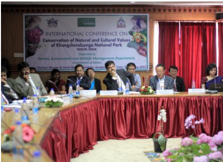
Technical session at Chintan Bhawan on Day 1