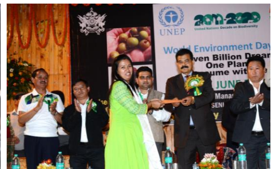
Release of School Eco-Club grants