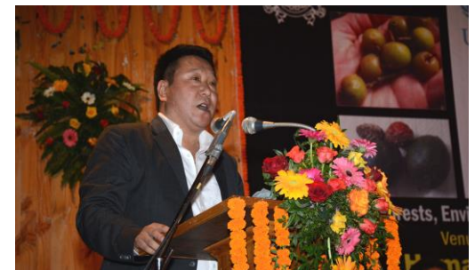
Address by Shri. T. W. Lepcha, Minister (Forests)