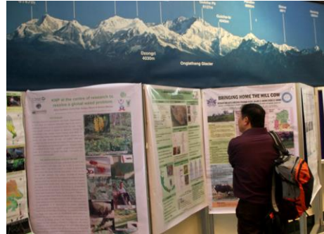
Photo/poster exhibition as side events