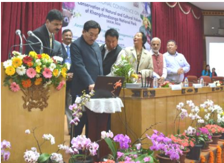
Launch of SBB and Ecotourism websites