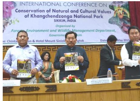
Release of special edition PANDA Newsletter