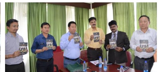
Release of publication on Environment Initiatives