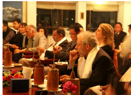
Ethnic food and culture for delegates